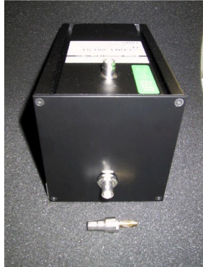
CDN Coaxial 50 Ohm, BNC