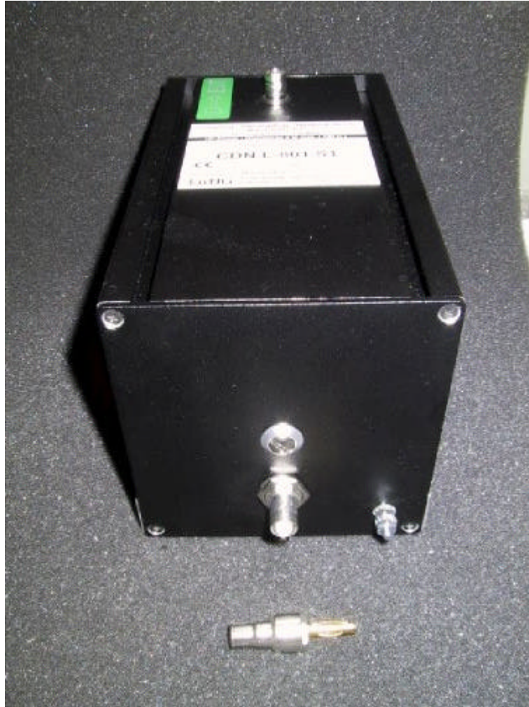
CDN, Koaxial 50 Ohm, BNC